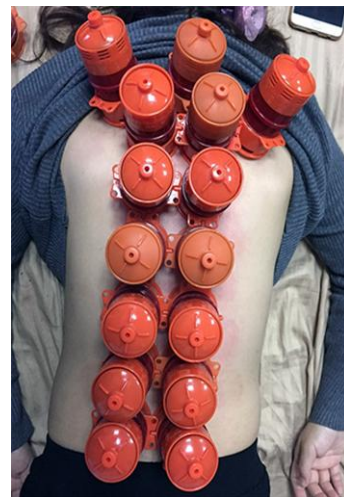
Figure 4. Shuang Long Xi Zhu (two dragons playing a ball) moxibustion

Method: After the patient took a prone position, open the cup and ignite moxa cone, and put the ignited moxa cone inside the cup and cover the cup. Place them respectively on Liangmen (ST 21) on the left, Zhongwan (CV 12), Liangmen (ST 21) on the right, Tianshu (ST 25) on the left, Shenque (CV 8), Tianshu (ST 25) on the right, Shuidao (ST 28) on the left, Guanyuan (CV 4) and Shuidao (ST 28) on the right. In accordance with pattern identification, place one cup on the corresponding four limbs and fix it (Figure 5).