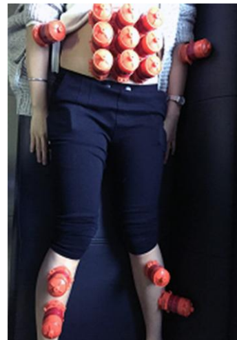
Figure 5. Abdominal Jiu Gong (nine palaces) moxibustion

The patient sick with phlegm should be treated by warming agents. In abdominal Jiu Gong (nine palaces) moxibustion, Shenque (CV 8) is selected as the core point. It is said in Dao Zang (Taoist Canon) that 'Shen' means extreme changes; 'Que' means middle gate. Therefore, Shenque (CV 8) is a spiritual middle gate in Chinese language, implying dignitary. The spirit is most valuable in the human body. This acupoint is an