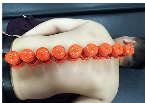
Figure 3. Chang Long (long dragon) moxibustion

Method: After the patient took a prone position, open the cup and ignite moxa cone, and put the ignited moxa cone inside the cup and cover the cup. Place nine cups on the Governor Vessel from Dazhui (GV 14) to Yaoshu (GV 2), linked like a dragon, then adjust the air vent to moderate and apply three moxa cones (Figure 3).